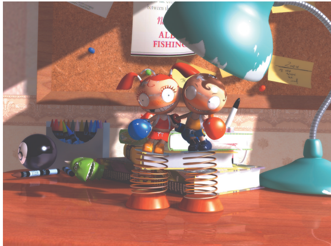
The Boxer © 2002 Tae Sik Shin, Tuba Animation Studio

Images created by SIGGRAPH contributors and used for promotional purposes must have a signed Submission & Authorization Form that grants permission to use the art. All imagery approved by the owner for SIGGRAPH publications must include full author/artist credit information.