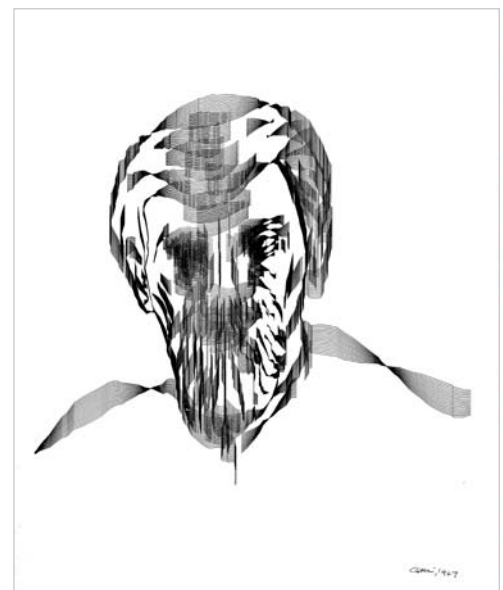
SineCurve Man 1967 © Charles Csuri